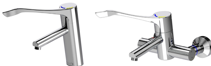
120mm spout shown with ATM607DX and ATM610X