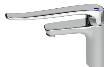
EXTENDED LEVER HANDLE OPTION