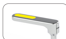
Blue, Red and Yellow colour indicator handles included