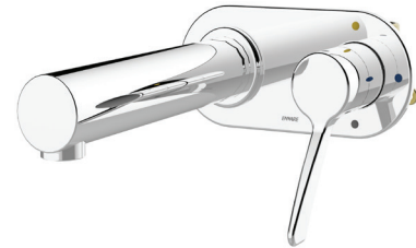
Shown with SPC203 Spout - sold separately