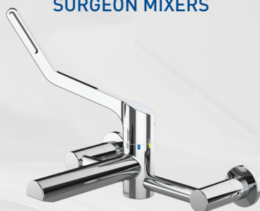
LEV150420SQ WELS 5 STAR