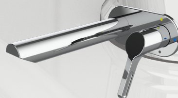
LEV80306WSQ-250 (SPC250 spout included) WELS 5 STAR