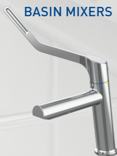
LEV150306SQ WELS 5 STAR