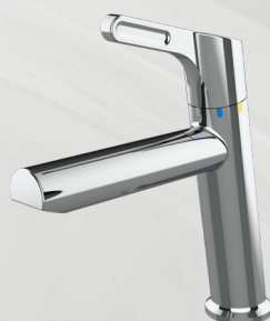
LEV80306SQ WELS 5 STAR