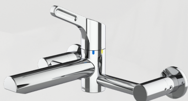
LEV80420SQ WELS 5 STAR